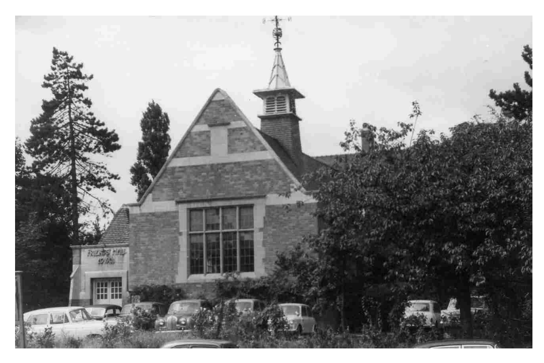
Figure 1: Cotteridge Mission Hall

Trust which was set up by George Cadbury. In 1906, the Warwickshire North Monthly Meeting received a request from the Friends in Cotteridge, who were meeting at the Mission Hall, for their Meeting to be recognised as a Preparative Meeting. In 1908, it is recorded that Cotteridge had a membership of seventy-one.