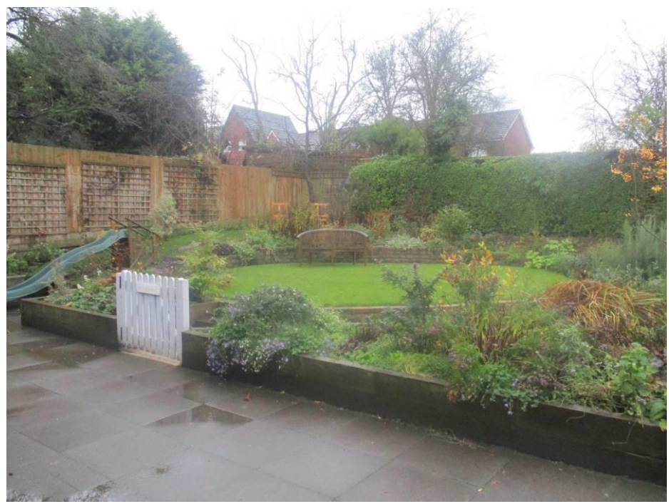
Figure 3: Cotteridge Meeting House Garden